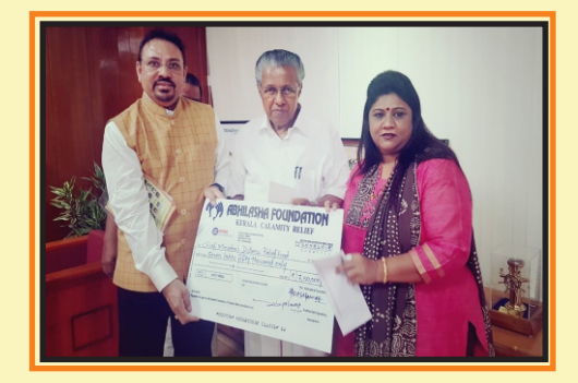
Calamity Relief: We make sure to respond promptly and extend immediate relief to the affected communities during natural calamities to deal with emergencies during earthquake, drought and floods.

Senior Citizens Support: Senior citizens who are isolated from the family & society are provided with nutrition, shelter, medical facilities, and other basic necessities etc.